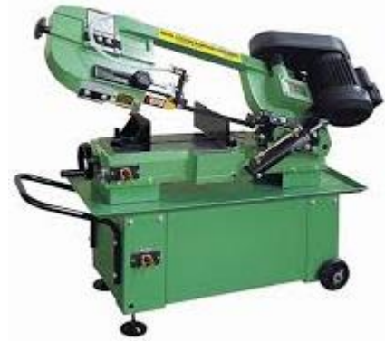
Horizontal Band Saw