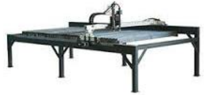
Torch Mate Plasma Cutter