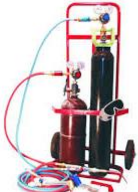
Oxy / Acetylene Gas Welder